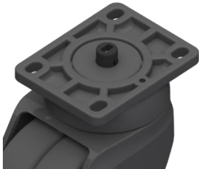
Central Wheel Lock