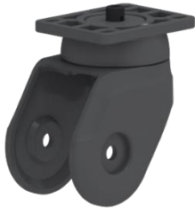
Lightweight nylon frame